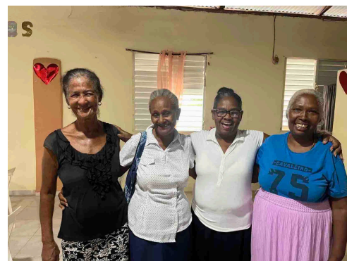
OUR WIDOWS ARE SO GRATEFUL