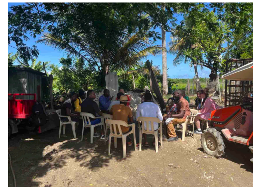
SUNDAY MORNING SERVICE HELD AT THE FARM