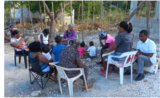
DISCIPLESHIP CLASS HELD EACH FRIDAY