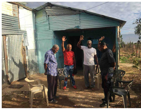
BILL'S FRIDAY MORNING PRAYER GROUP